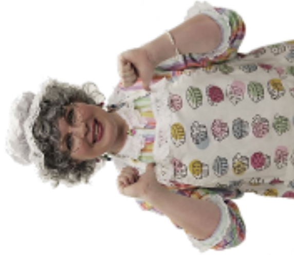
I (thumbs to chest)