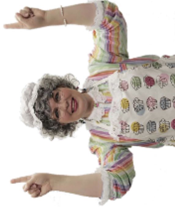
Jesus! (point up)