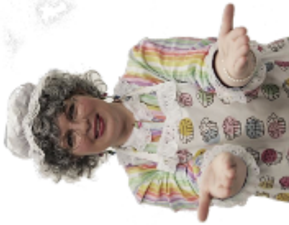
Can Help (reach out, palms up)